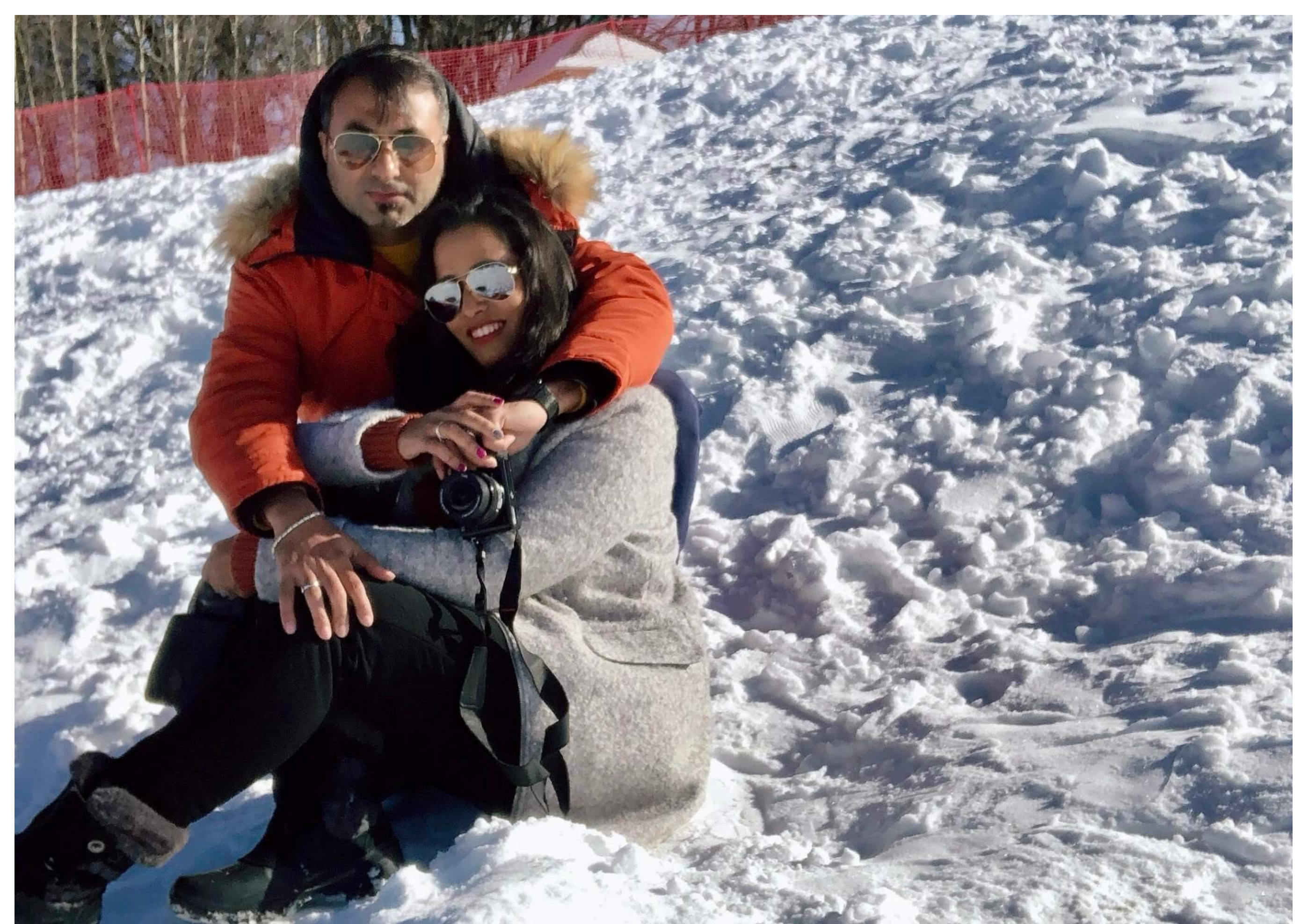
If you're visiting in the winter like I did, you're bound to find snow up on these mountains. So even if there is no snow, down below, in the city of Gabala, be sure you'll find some up here. Hence, I'd say dress accordingly. We were very lucky to have visited this incredible place on a bright and sunny day. The views from the mountains were clear and we were almost above the cloud cover. There aren't enough words to describe the beauty; you have to be there.

Located on top of the mountains, at 1920 m above sea level, the Tufandag Mountain Sky Resort is a place hard to miss. Apart from being one of the most popular places in Gabala, it's a spectacular destination for those wanting some adventure at Gabala. Don't forget to take a breather in the Chalet Steak & Wine House.